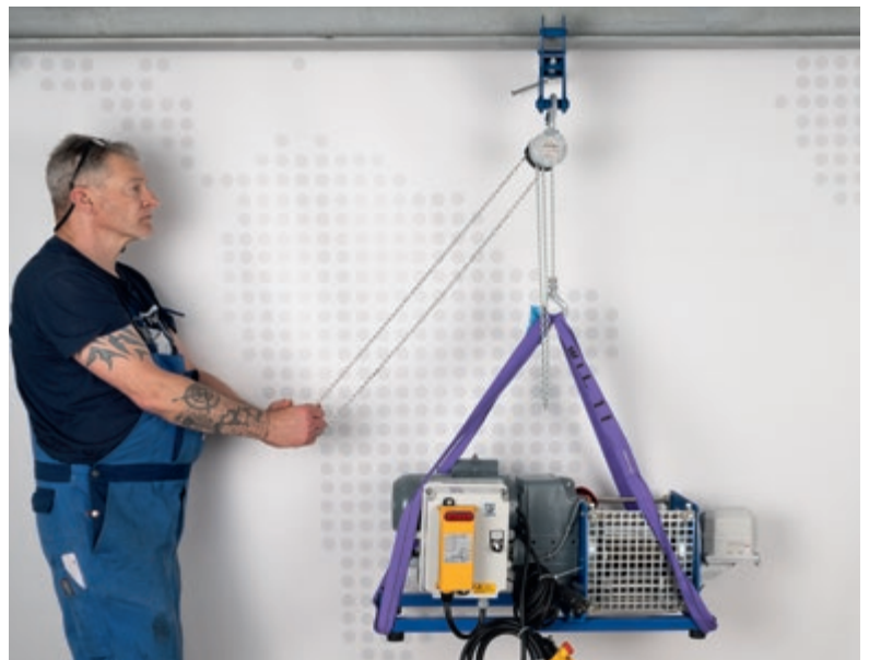
Application example: Operator standing to the left of the load