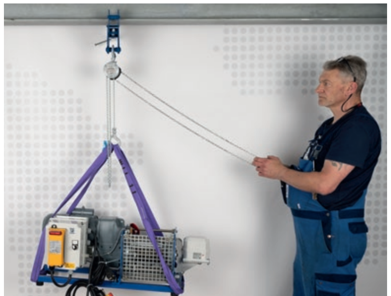
Application example: Operator standing to the right of the load