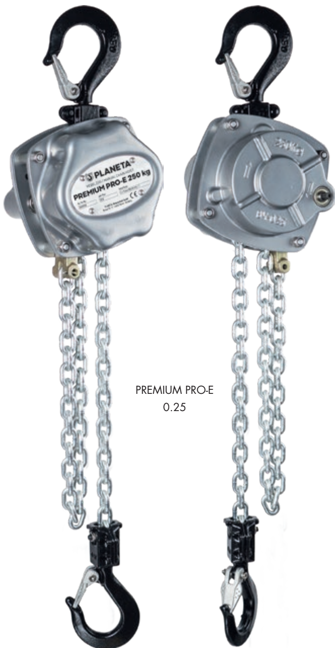
PREMIUM PRO-E 0.25