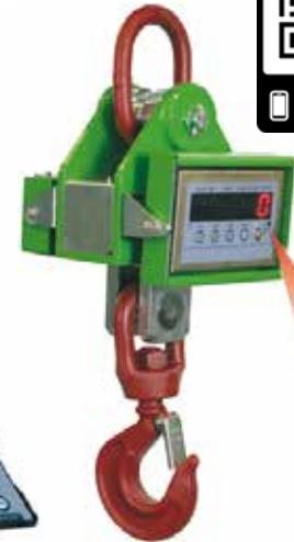
MCWHU with standard remote control