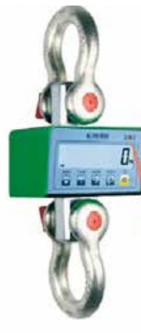
MCWNT with standard remote control